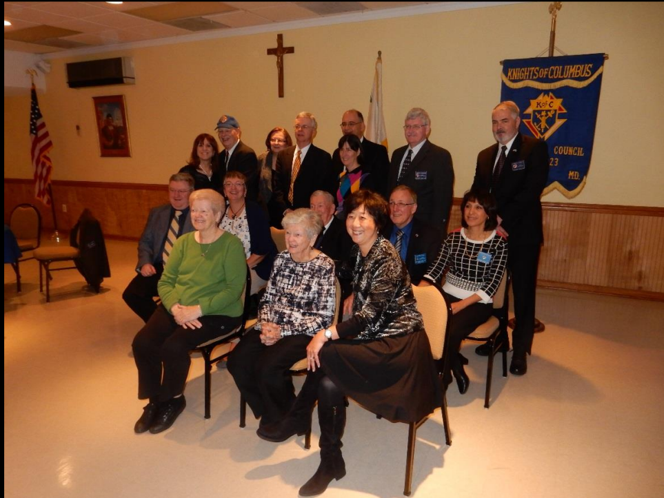
A Past Grand Knights Dinner photo too good to pass up: PGKs with their wives and PGK widows.

A national TV distribution in the United States and a theatrical distribution in Poland is planned for spring 2016. For more information about the film, visit jp2film.com .