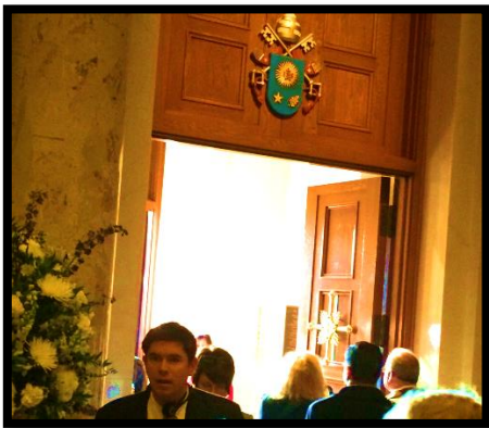
The Holy Door at the Basilica of the National Shrine of the Immaculate Conception.

Supreme Council has developed a new program called the “Fifth Sunday Rosary Program.” We all know that the Rosary offers a great opportunity for Knights of Columbus members and their families to strengthen their faith. Community devotions also can give families opportunities to experience the faith and fellowship of the Order. In the spirit of the “Walk with Francis” pledge, I pledged to pray the Rosary on the fifth Sundays of the 2015-2016 Fraternal Year. The next one will be Sunday, January 30, 2016. I challenge my brother Knights to join me in praying the Rosary at 7 p.m. in the rectory chapel at St. Francis of Assisi Church, Derwood, Md. Other family members are welcome to pray with us as well. And I wish you and your family and Happy & Holy Christmas!